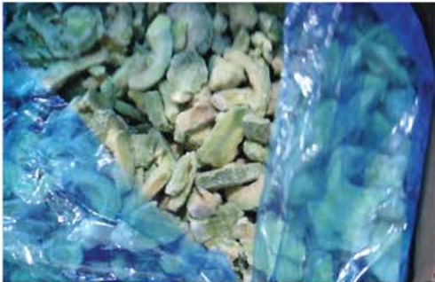
Cardboard box with frozen crystallized product.