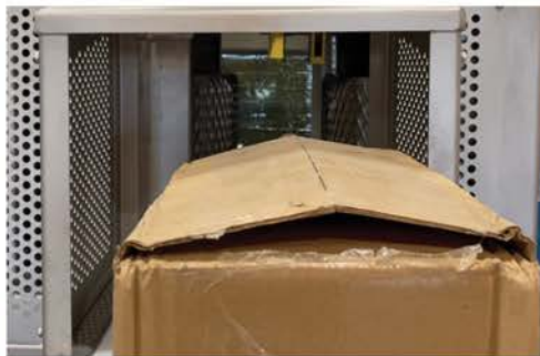
Box exits on opposite side.