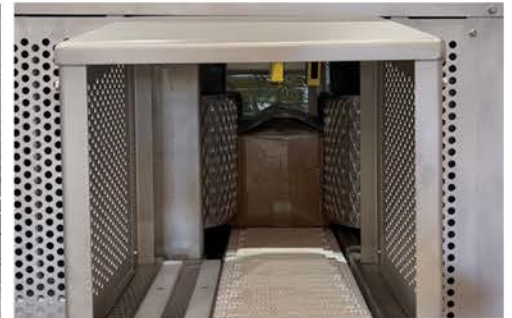
Push sealed box into machine.