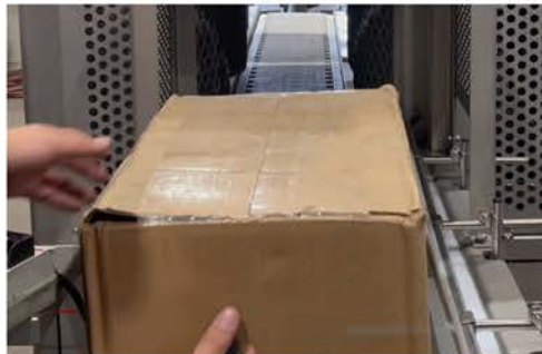
Sealed box placed on conveyor infeed.