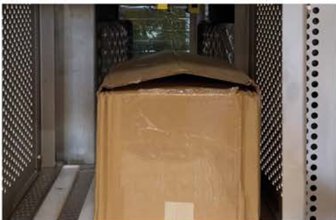
Crush rollers pull boxes through the machine.