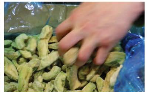
Product separated into individual pieces.